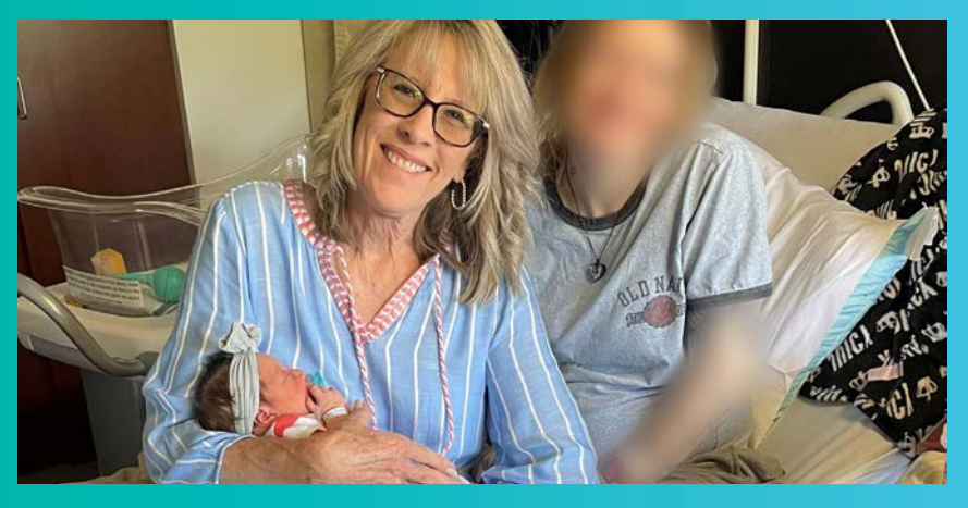
*Name changed to protect client confidentiality.

Thank you for helping us to share tangible acts of love to people in "places far away."